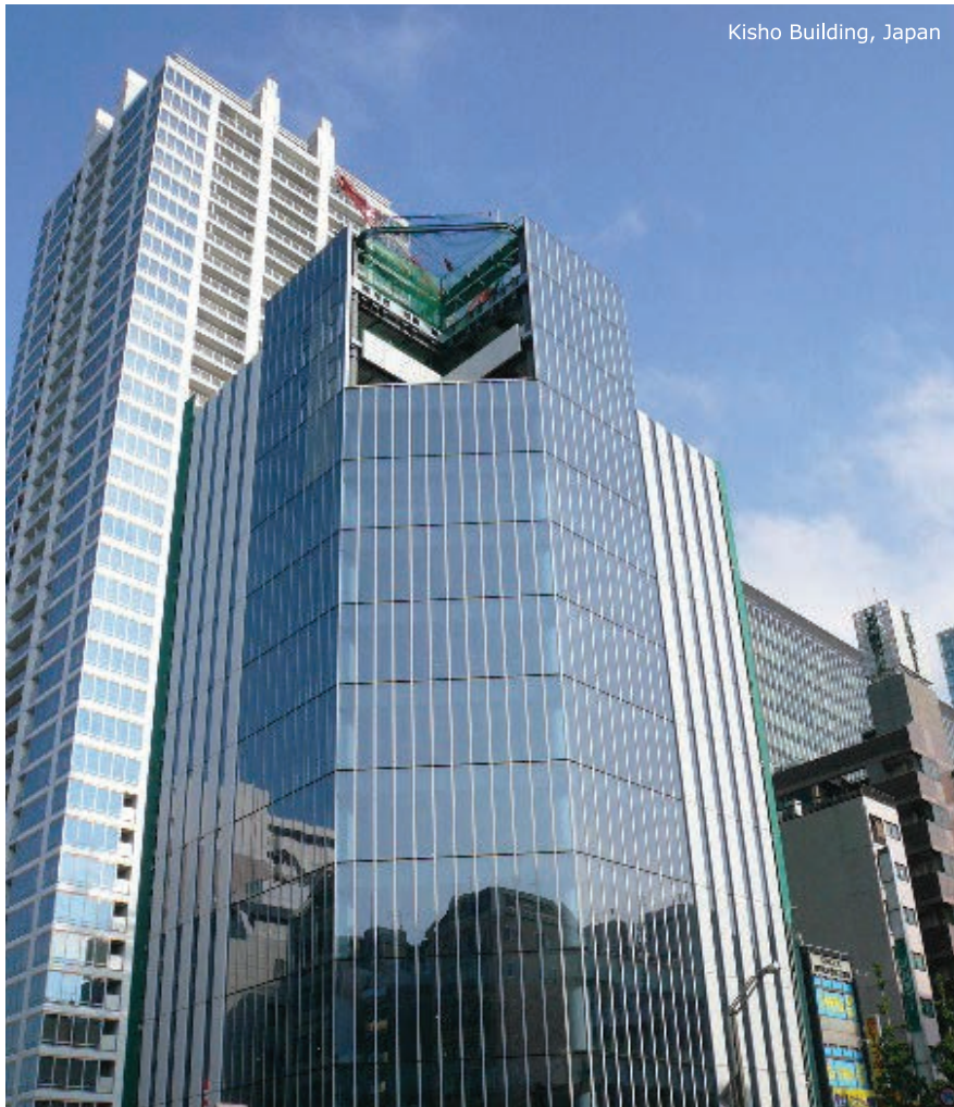
Kisho Building, Japan