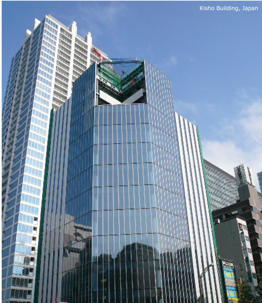
Kisho Building, Japan