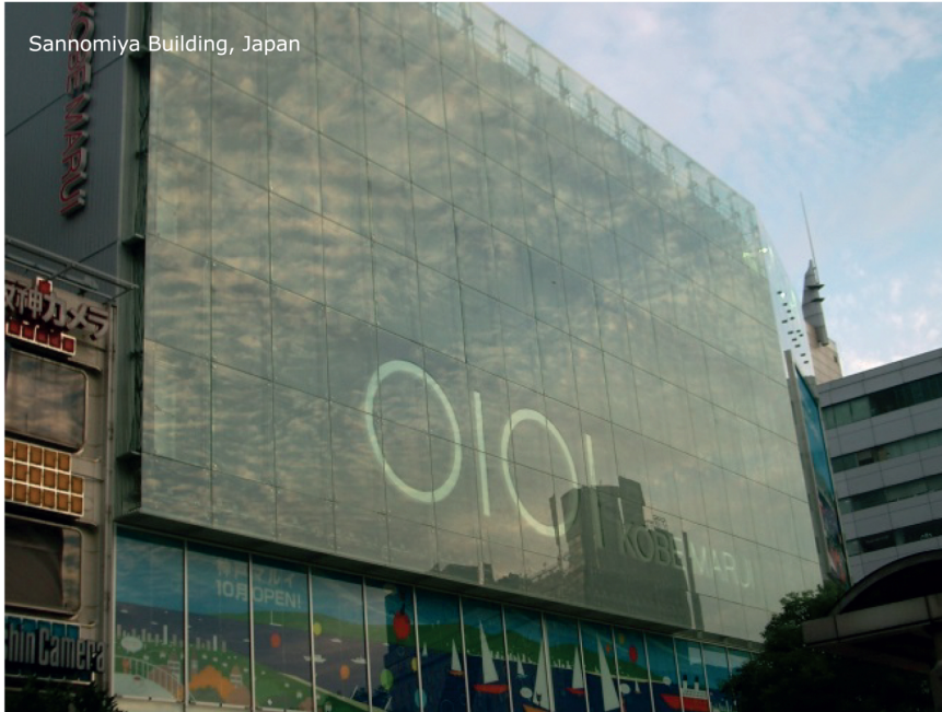
Sannomiya Building, Japan

SSG® Concealed Point Glazing (CPG) System is a specially designed proprietary point fixed system that is concealed within the laminated glass façade structure. Traditional structural glazing systems have its point fixing elements designed to flush with the glass surface. However, through the development of technology and materials, it is now possible to have a seamless exterior glass façade with the adoption of the SSG® CPG system.